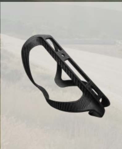
RCF Bike Bottle Cage with Braided Pattern

The carbon fiber material is both durable and lightweight, providing a smooth and unhindered riding experience. The use of recycled materials not only enhances environmental sustainability but also contributes to carbon reduction. Enjoy the exhilaration of wind-aided cycling while making a positive impact on the environment with our eco-conscious and stylish bike accessories.