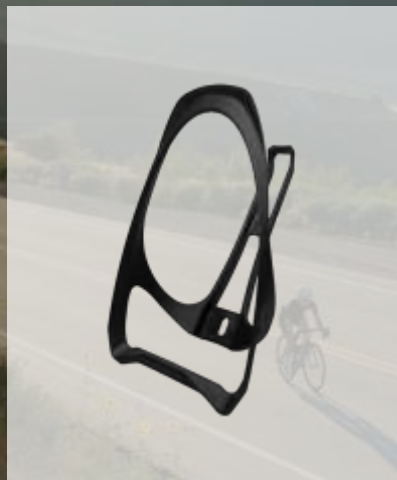
RCF Bike Bottle Cage