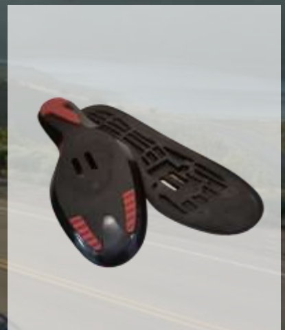
Road Bike Shoe Sole